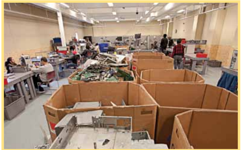
Computer Recycling Center, located in the Lawrenceville section of Pittsburgh, processes thousands of donated computers annually