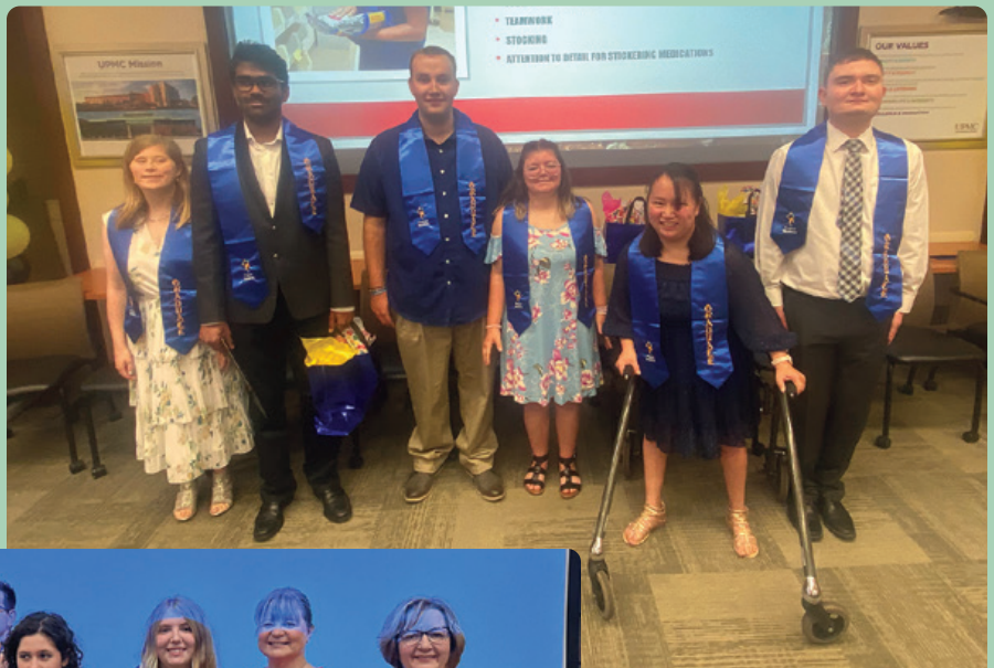
Above: UPMC Passavant graduates

May was graduation season and Goodwill SWPA joined in the celebration by recognizing 12 Project SEARCH graduates at UPMC Mercy and UPMC Passavant hospitals. Project SEARCH is a unique, business-led, one-year employment preparation program for high school students with disabilities. The program takes place entirely at the workplace, where students fully immerse themselves in the workplace environment.