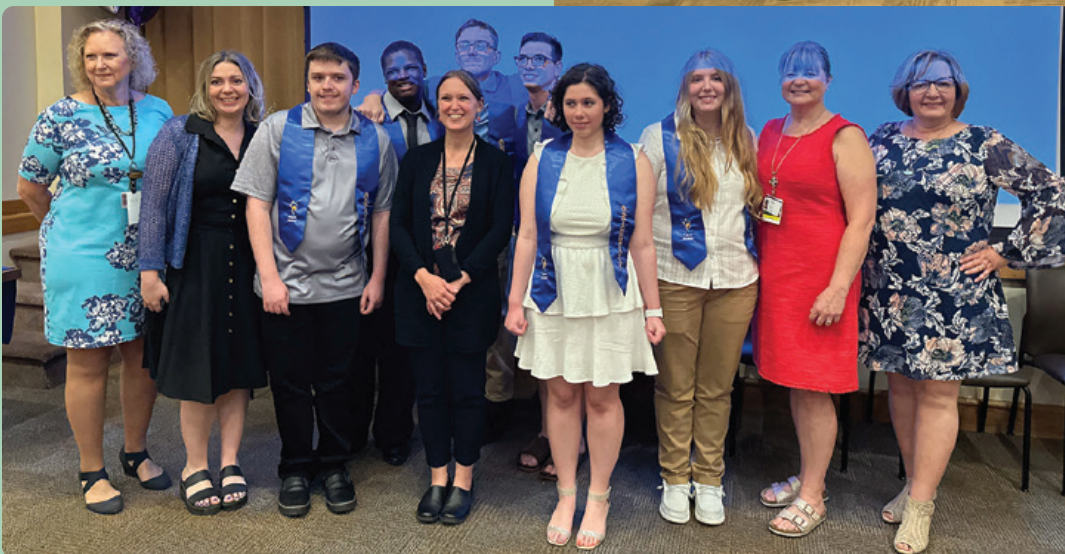
Left: UPMC Mercy graduates